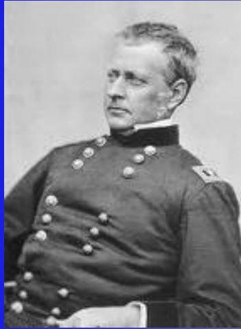
"Fighting Joe" Hooker, fired