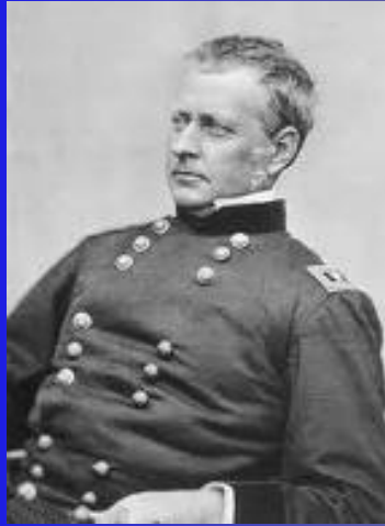
"Fighting Joe" Hooker, Army of the Potomac