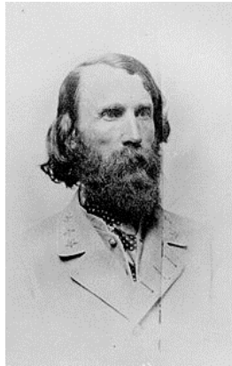
Conf. Gen. AP Hill led the Confederate advance.